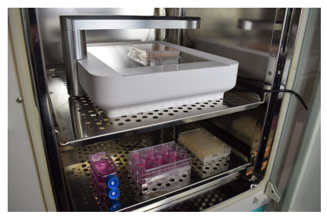
Figure 2. The well plate is placed on the CytoSMART® Omni situated inside an incubator.

CHO-K1 cells were seeded in a 48-well plate at different densities ranging from 2,600 to 36,400 cells/cm<sup>2</sup> in HAM's F12 nutrient mixture supplemented with 10% FBS and 1% penicillinstreptomycin (n=6 for each group). Immediately after seeding, the 48-well plate containing the samples was placed on the CytoSMART<sup>®</sup> Omni which was placed inside an incubator (37°C and 5% CO<sub>2</sub>; Fig 2.). For the duration of 70 hours, the complete well plate was imaged every two hours. The CytoSMART<sup>®</sup> image analysis software was used for well detection and determining the confluency of each individual well.